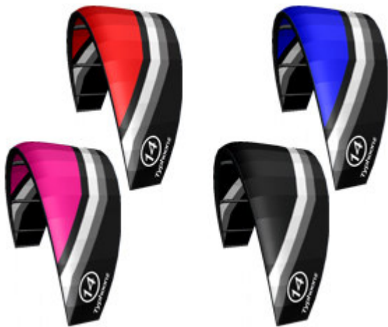
Available colors: Red, Blue, Pink & Black