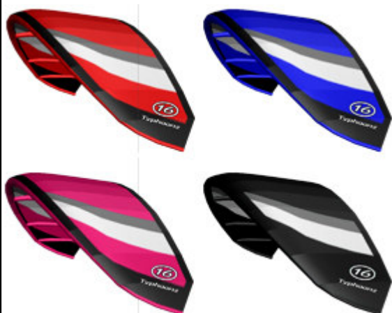
Available colors: Red, Blue, Pink & Black